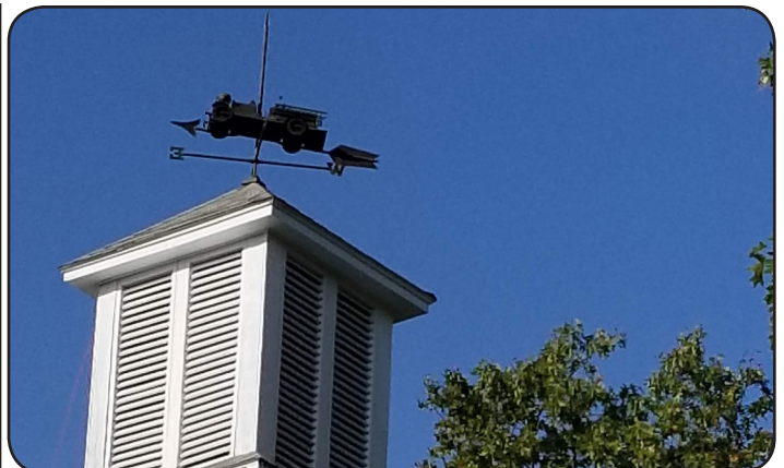
The cupola atop the museum has been repaired and painted

THE MUSEUM IS CLOSED FOR VISITORS UNTIL FURTHER NOTICE AS A MEASURE TO PROTECT THE SAFETY OF OUR MEMBERS THROUGH SOCIAL DISTANCING.