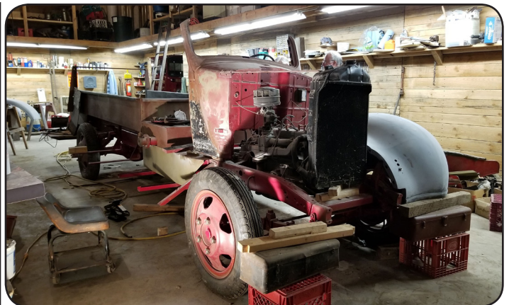
Work on the Bunny Wagon progresses.

THE MUSEUM IS CLOSED FOR VISITORS UNTIL FURTHER NOTICE AS A MEASURE TO PROTECT THE SAFETY OF OUR MEMBERS THROUGH SOCIAL DISTANCING.