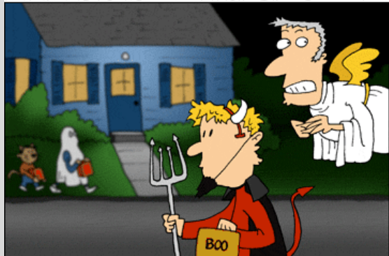
10-30-2006 SOME COSTUME CHOICES RESULTED IN VERY AWKWARD EVENINGS FOR MANY A GUARDIAN ANGEL