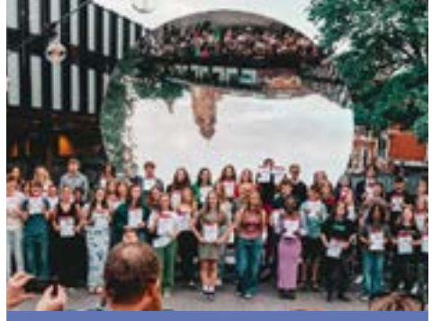
Deadline: Monday 24 March

Find out more: Get involved in Wicked Writers