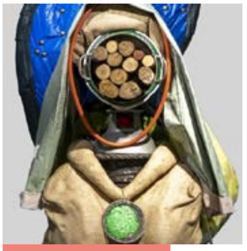
Thurs 6 February

Contact <u>cathy.mahmood@ntu.ac.uk</u> if you'd like a short slot to share, or have any questions. <u>Book your free place</u>