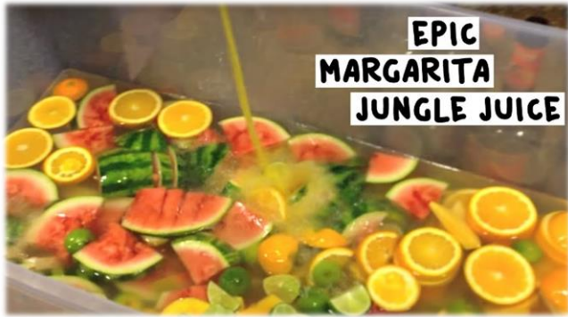
EPIC MARGARITA JUNGLE JUICE

(Alcoholic Party Sangria, Fruit Punches, Iced Teas & Sherbet Frappe's...Pitcher Cocktails are a Lifesaver for Parties!)