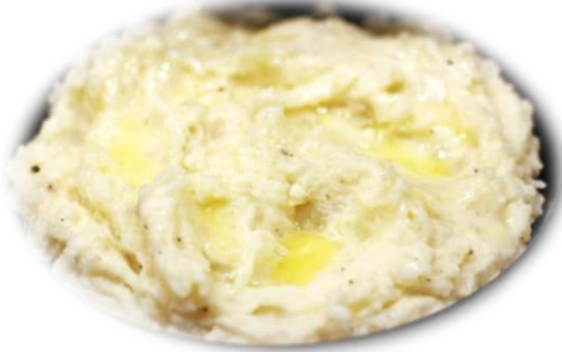
Garlic Parmesan Mash Potatoes