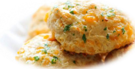
w/ Red Lobster's Cheddar Bay Biscuits