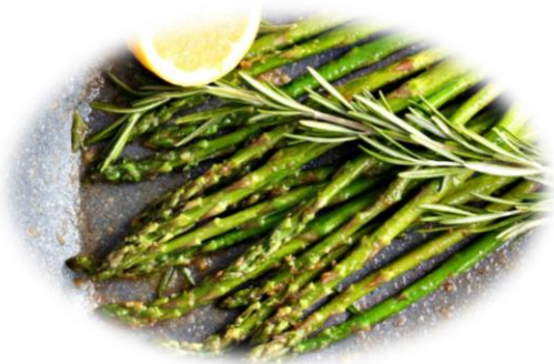
Roasted Asparagus w/ Garlic, Rosemary & Lemon

Elevate Your Dinner-Party Charcuterie Board Pkg. w/ 1 or 2 of Our Creamy 5 Cheese Mac Dinner Party Skillet (Side Add-ons)! A Fantastic Side Addition to Our Dinner-Party Pkgs. We have 3 Serving-Style Options: A Colossal Event Buffet Style Portion, Individual Portions or A "Tasting Mini-Style" Servings. Our 5 Star Culinary Event Team will Make it Happen for Your Private Dinner Service Celebration! You Guests will Not Be Disappointed!