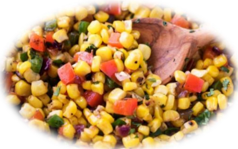
Southwestern Corn w/ Cilantro