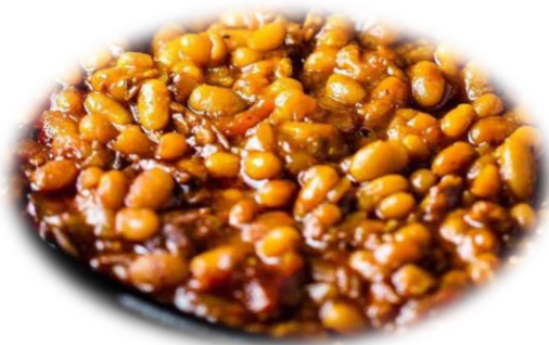
Southern-Style Baked Beans