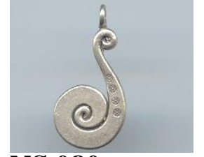
NS 080 3 gr