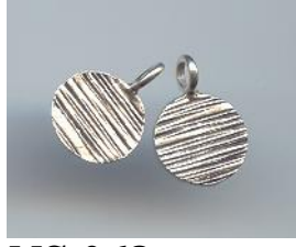
NS 068 1 gr