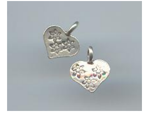
NS 075 0.7 gr