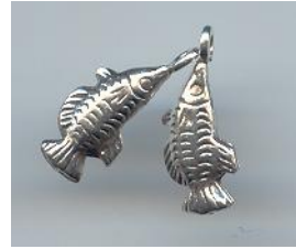
NS 059 1.7 gr