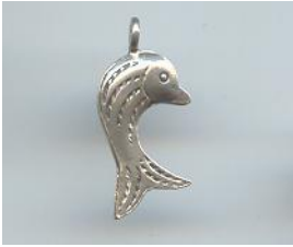
NS 056 1.4 gr