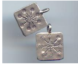
NS 072 1.8 gr