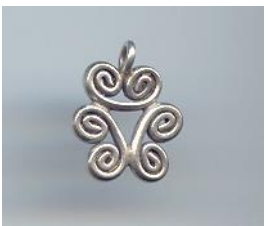
NS 081 2.8 gr