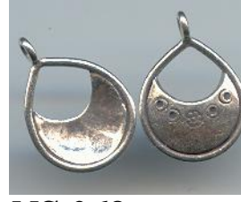
NS 069 2.4 gr