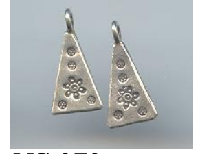
NS 070 1.5 gr