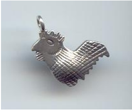
NS 061 2.7 gr