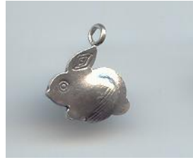
NS 062 2.8 gr