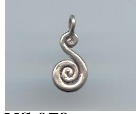
NS 079 1.7 gr