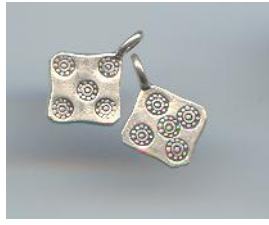
NS 073 1 gr