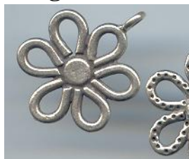
NS 083 4.7 gr