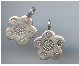
NS 071 1.7 gr