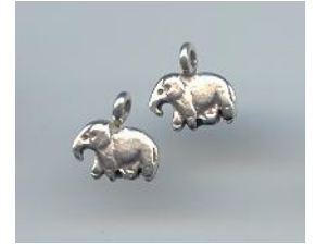
NS 065 1.1 gr