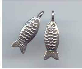
NS 058 1.2 gr