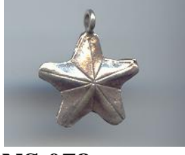
NS 078 2.5 gr