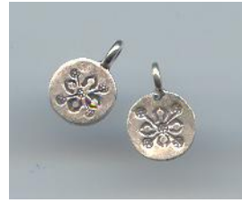
NS 074 1.1 gr