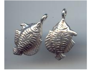
NS 060 2.3 gr