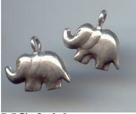
NS 066 1.8 gr