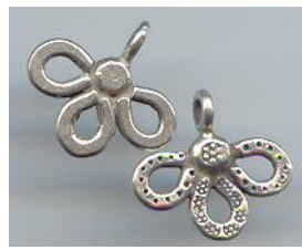
NS 082 2.4 gr