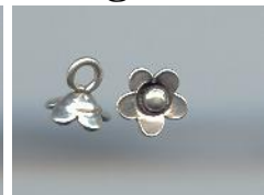
NS 158 0.7 gr