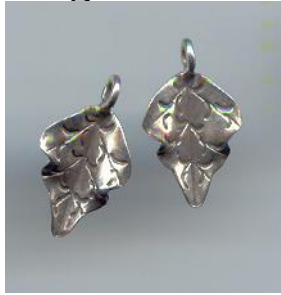
NS 146 1 gr