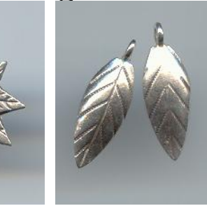
NS 150 2.2 gr