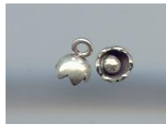
NS 157 0.9 gr