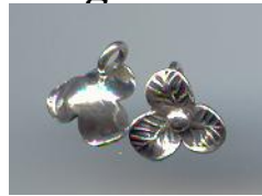
NS 163 0.8 gr