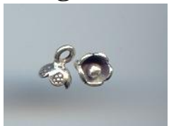
NS 155 0.6 gr