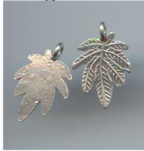
NS 148 1.6 gr