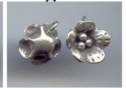
NS 166 0.9 gr