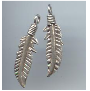
NS 145 1.9 gr