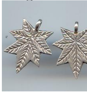
NS 149 2.1 gr