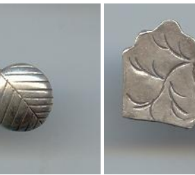
NS 153 2.1 gr