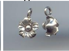
NS 164 0.7 gr