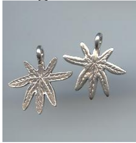
NS 147 1.3 gr