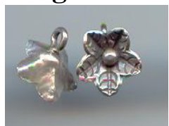
NS 168 1.1 gr