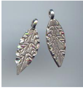
NS 142 1.4 gr