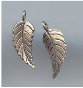
NS 141 1.9 gr