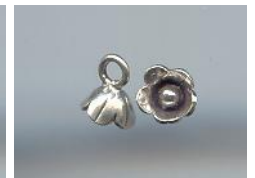
NS 160 0.7 gr