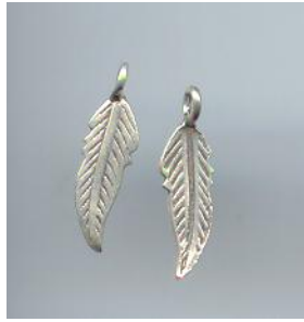
NS 144 1.1 gr