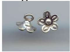
NS 162 0.9 gr