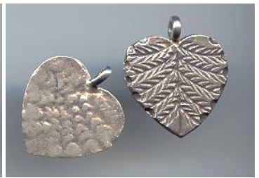
NS 154 2.8 gr