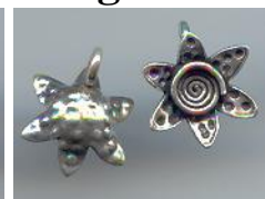
NS 171 1.7 gr