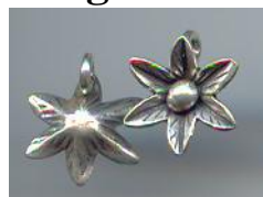
NS 169 1.3 gr