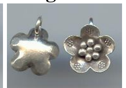
NS 172 1.6 gr