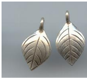
NS 151 2.5 gr