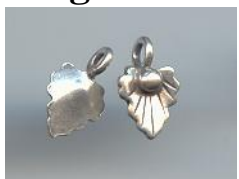
NS 167 0.85 gr