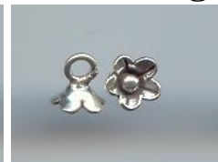
NS 159 0.7 gr