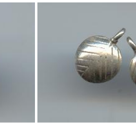
NS 152 2.4 gr