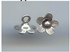
NS 161 0.8 gr