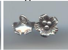
NS 165 0.9 gr