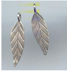
NS 143 1.4 gr