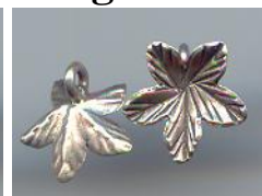
NS 170 0.9 gr