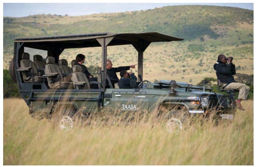
EXCLUSIVE LUXURY SAFARI FOR 2021 AVAILABLE FOR A LIMITED TIME

▼ ENJOY meeting the locals and learn first hand about their innovative community projects