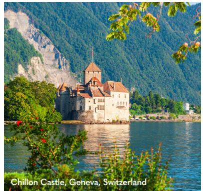
Chillon Castle, Geneva, Switzerland

All prices are in USD, per person in Category E stateroom, based on double occupancy; port charges and stateroom upgrades are additional. Solo travelers must pay standard cruise single supplement to receive a Complimentary Land Package offer.