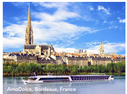
AmaDolce, Bordeaux, France