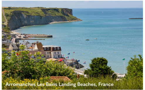
Arromanches Les Bains Landing Beaches, France

With nearly 16 years cruising French rivers, AmaWaterways has curated an array of authentic experiences in every region. Marvel at the impressive Rouen Cathedral, where Richard the Lionheart's heart was laid to rest. Walk along the Normandy beaches where brave soldiers once stormed the banks. Visit the centuries-old Castle of Roquetaillade or explore Dijon and the wonders along the Saône River in Burgundy.