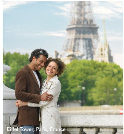
Eiffel Tower, Paris, France

All prices are in USD, per person in Category E stateroom, based on double occupancy; port charges and stateroom upgrades are additional. Solo travelers must pay standard cruise single supplement to receive a Complimentary Land Package offer.