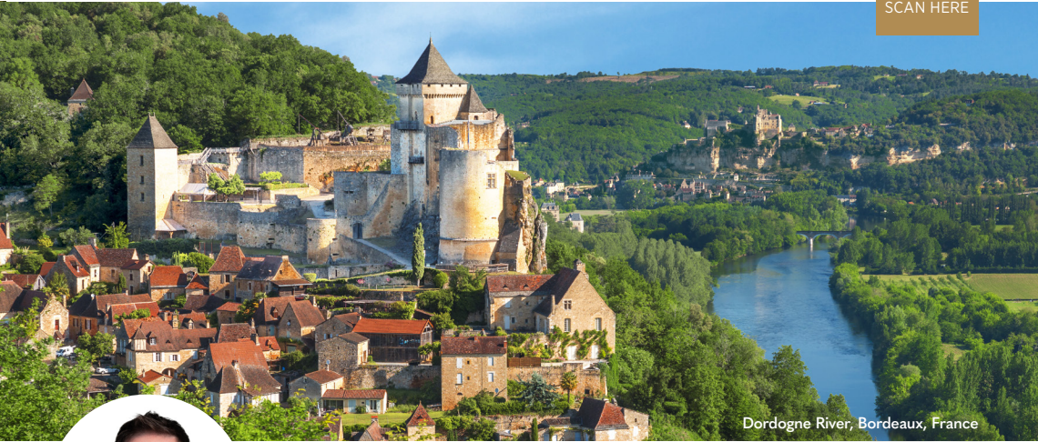
Dordogne River, Bordeaux, France