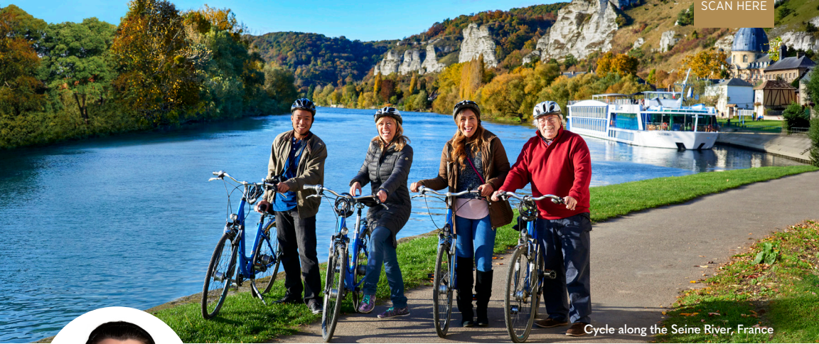
Cycle along the Seine River, France