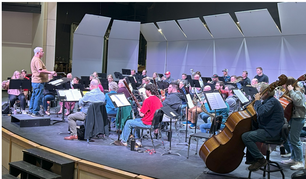
Dress Rehearsal Union High School Performing Arts Center 3.6.2025