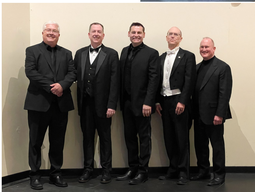
Concert Day Union High School Performing Arts Center 3.9.2025