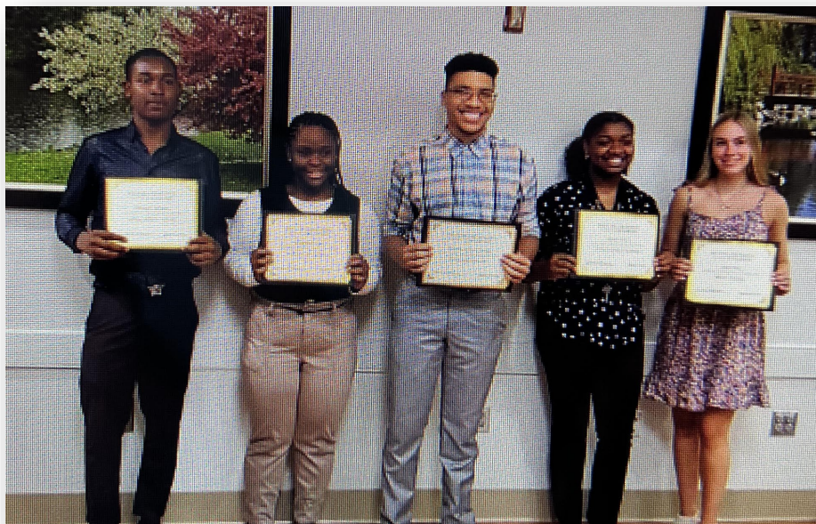
Pictured are scholarship recipients that were able to attend the June Volunteer Luncheon.

On June 8, 2022, the Wellstar Cobb Hospital COVS Scholarship Committee interviewed fifteen exceptionally smart and articulate young people who applied for a scholarship with us. We are allowed to award $2500 scholarships from six to ten applicants yearly. The committee was impressed with all of the applicants, and it was difficult to choose from these very qualified applicants. The applicants are scored using: scholastic records, quality of responses and overall impression. If the applicant is an employee or volunteer, they are given an extra point in the process. We narrowed it down to eight recipients for the 2022-2023 school year. A huge congratulations to these outstanding students for their hard work and dedication. We wish you all the best in your studies ahead and look forward to watching your progress!