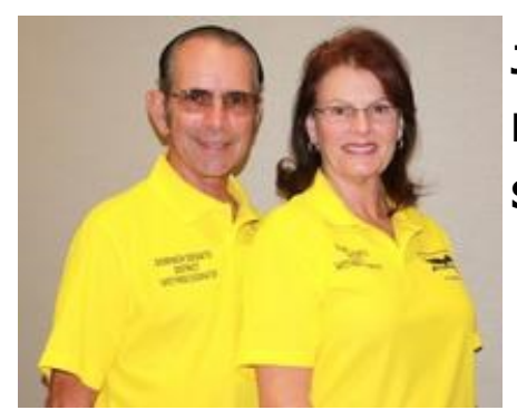
July, 2024 Florida District Safety/Ride Coordinators Safety Article