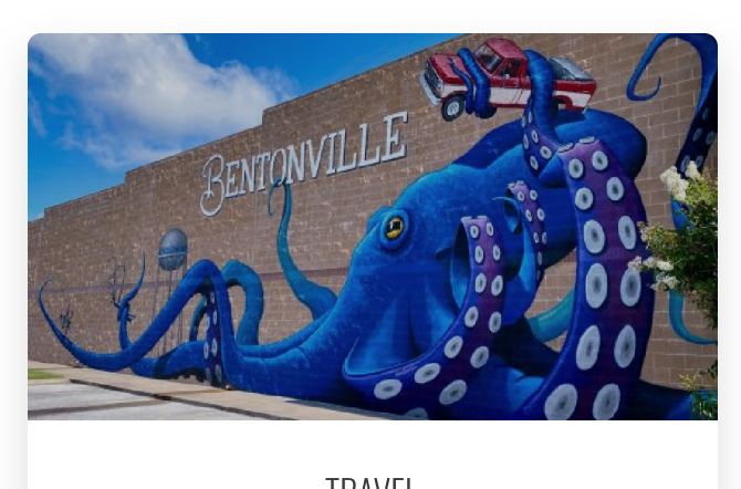
TRAVEL A WEEKEND GETAWAY IN BENTONVILLE, AR