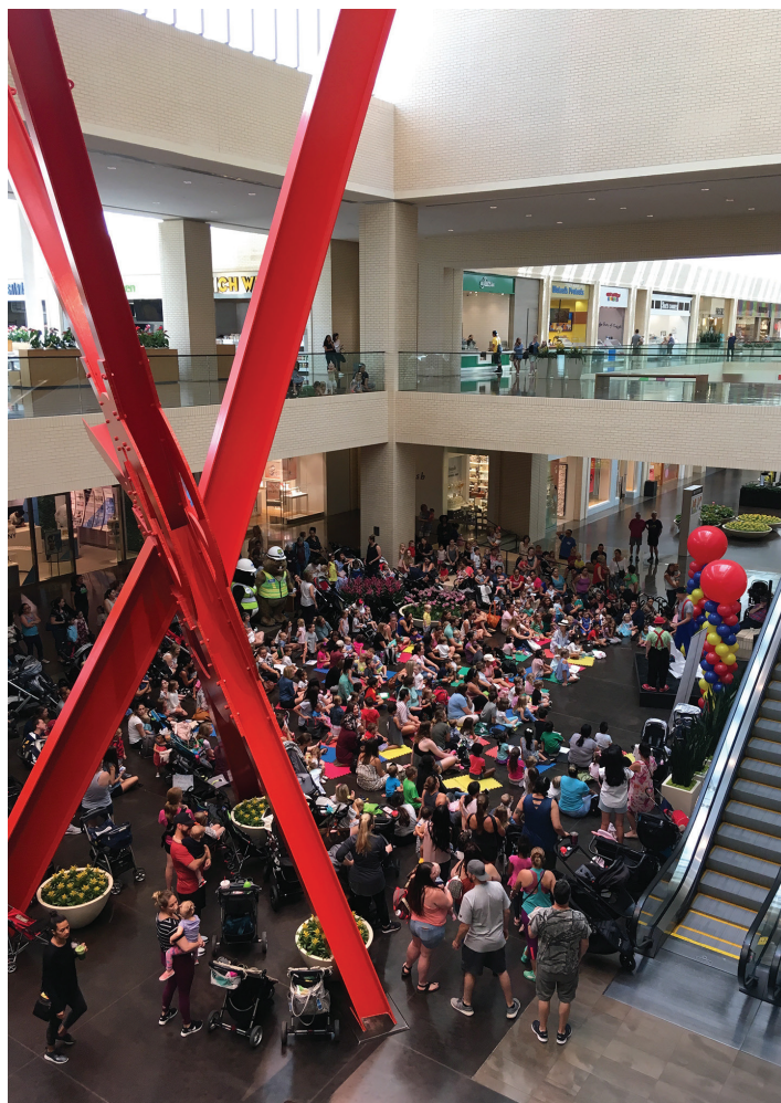
With generous support from Atmos and others, Friends of the Dallas Public Library provides 100% of programs at Bookmarks at NorthPark Center.

As the nonprofit fundraising partner for the Dallas Public Library, we invest in stronger communities, a more literate Dallas, a job-ready workforce, lifelong learning and equal opportunities for success. Our public library system, and your support, make this possible.