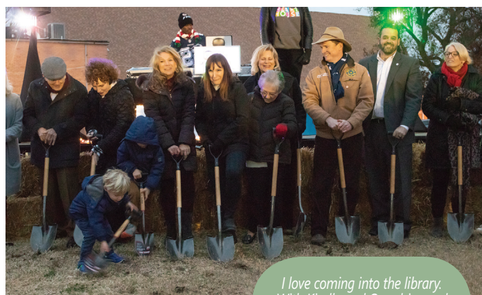
After years of waiting, the Vickers Meadow branch will become a reality thanks to the citizens of Dallas with enhancements provided by gifts and endowments.

The leadership of the Friends has considered the Library's budget and plans and recognizes that private gifts and bequests must continue – as they have historically – to be an important part of the total funding structure of the Library, making possible those special things that public funds are not likely to provide. This will be especially significant in maintaining and expanding the Library's holdings in books and other materials; but it will also be vital in securing the newest technologies that arm the Library to serve its customers.