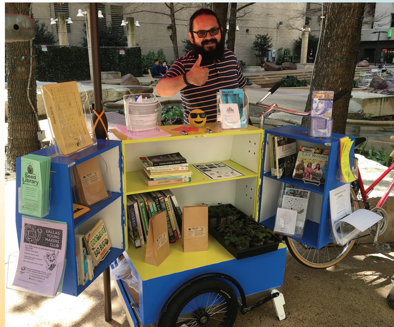
Innovative ideas like the Book Bike let the Dallas Public Library reach people in new and unexpected ways.

Vickery Meadow Branch Children's, Teen and Adult Learning Centers — $752,455