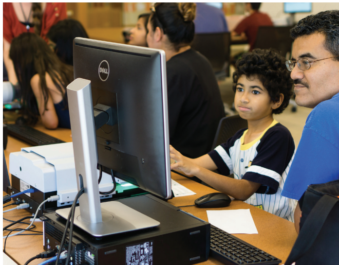
Programs to inspire curiosity in science, math, art, reading and technology.

Library staff appreciation, advocacy, scholarships and career development — $71,334