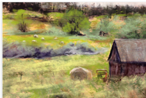
One of many pastels she has done of the Colorado landscape