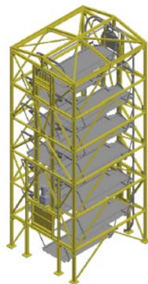
Prepared for cladding Single 1x1