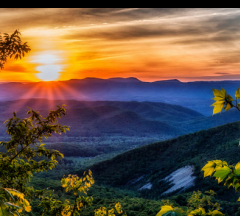
Blue Ridge Mountains