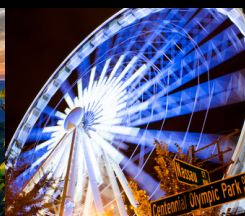
Centennial Olympic Park