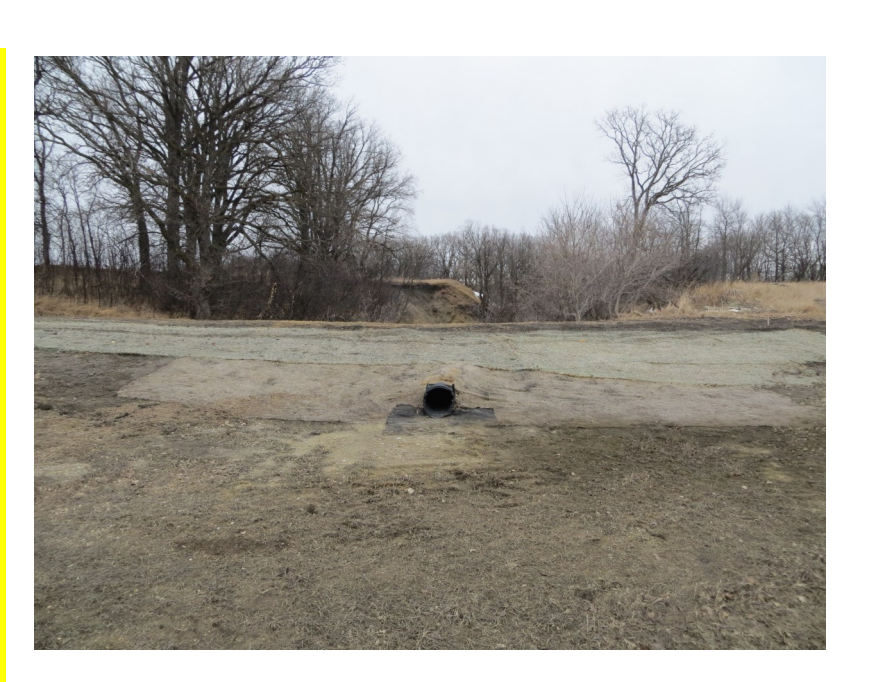
Water Management Project