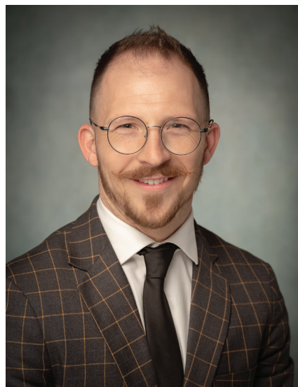
Energy Justice Business and Program Analyst U.S. Department of Energy