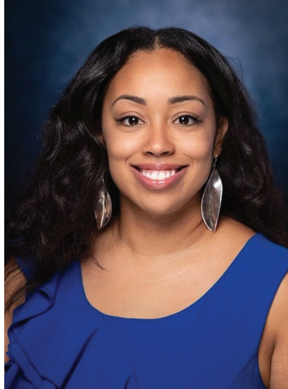
Chief of the Minority Business and Workforce Division U.S. Department of Energy