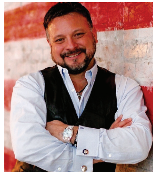
Founder/CEO Solex PR LLC