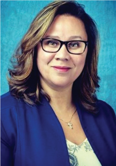
Rural Development Louisiana State Director USDA