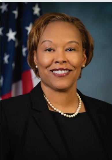
Assistant Secretary for Congressional and Intergovernmental Relations U.S. Department of Housing and Urban Development