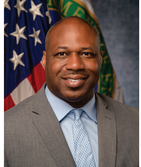
Director Office of State and Community Energy Programs U.S. Department of Energy