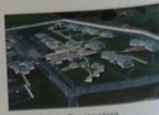
Otago Prison Construction New Zealand 2005 - 2007