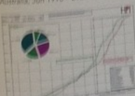
Updated EVPM Schedule Showing Baseline & Earned Value Performance Plus Pie of Hours by Zone