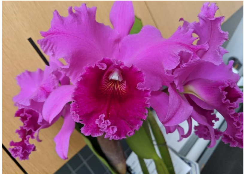
Cattleya Blooming from our show table