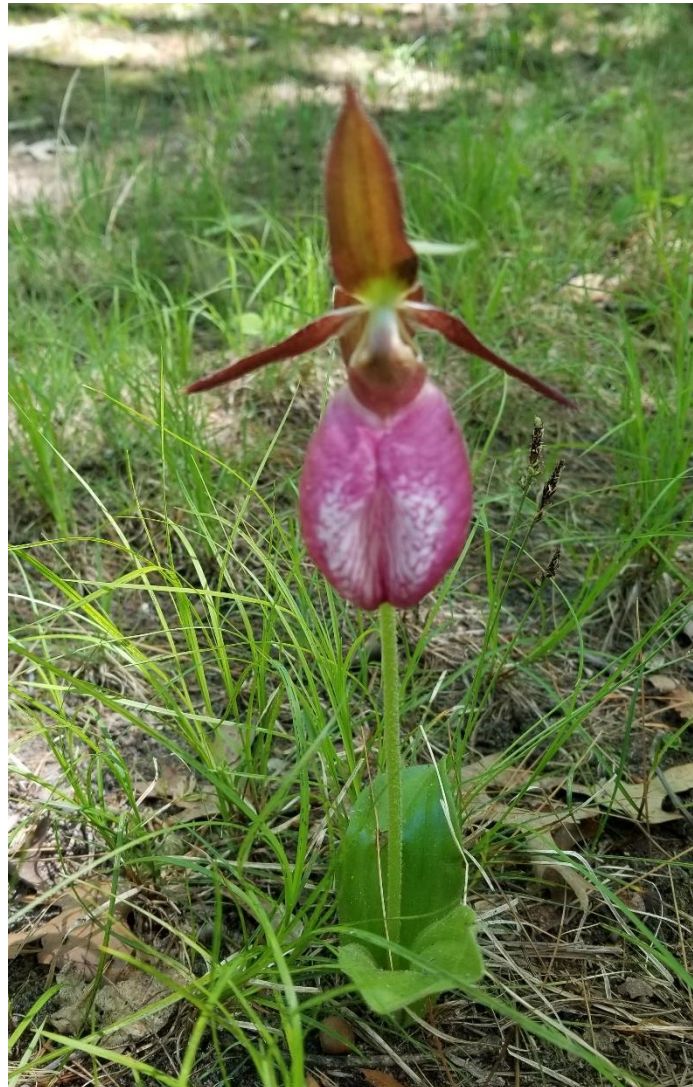
An orchid growing in the garden of one of our members