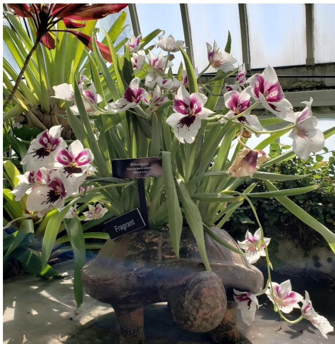
Miltoniopsis blooming in Phipps Conservatory in Pittsburgh, Pennsylvania