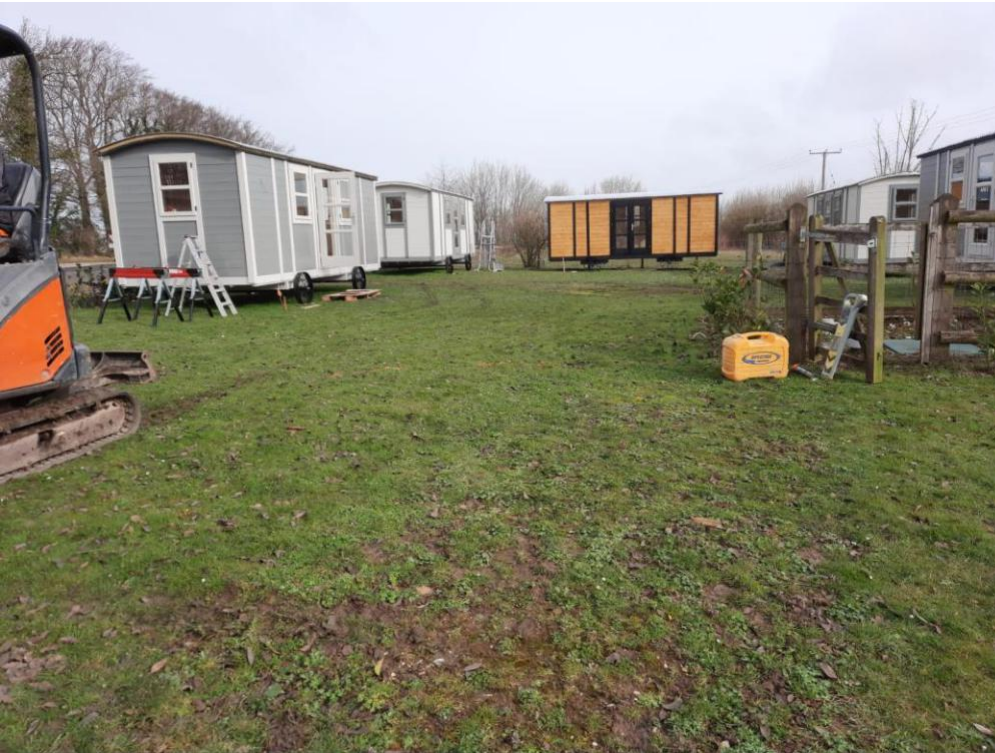
Plate 1 North facing view of area of intrusive works showing layout of Shepherd's Huts prior to works