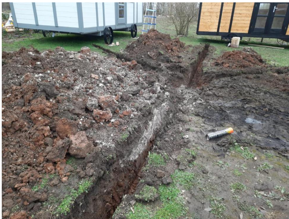
Plate 3 North-north-west view of main trench and branches to the shepherds huts. Modern disturbance of the topsoil/subsoil from previous use evident