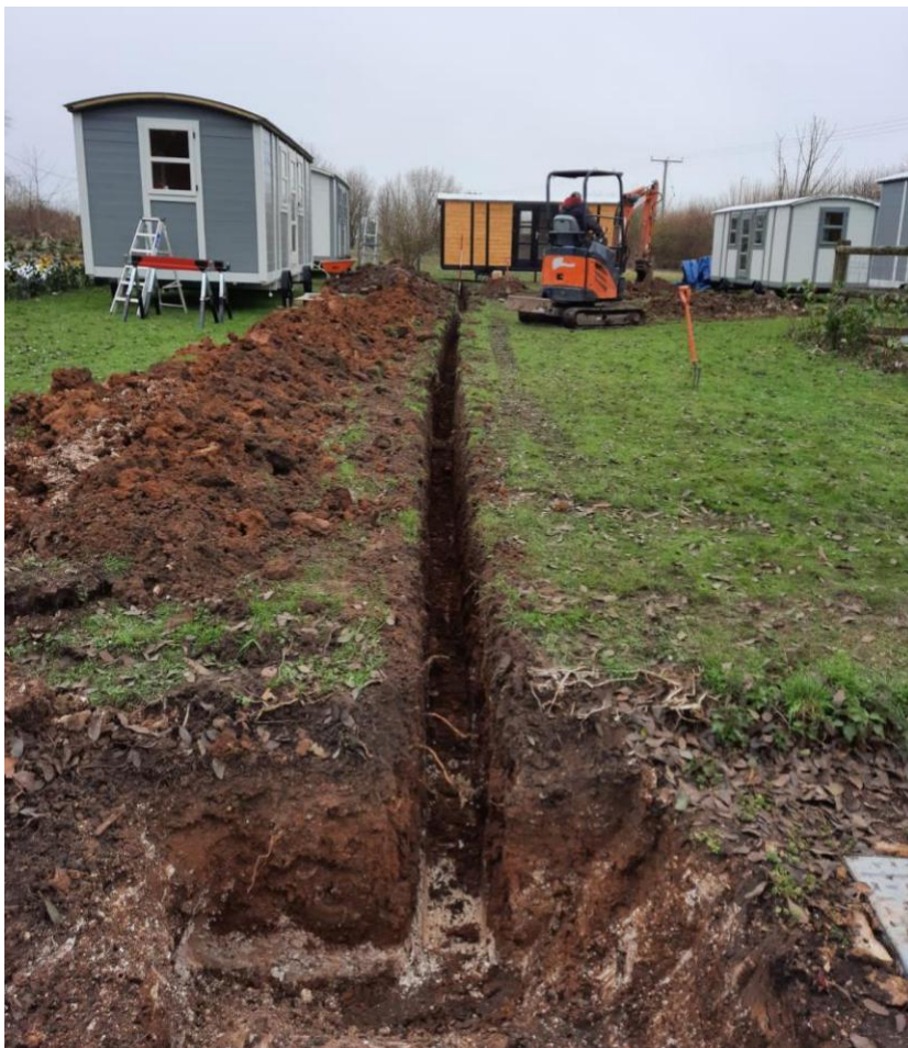
Plate 2 North-north east view of main trench from sewer manhole junction