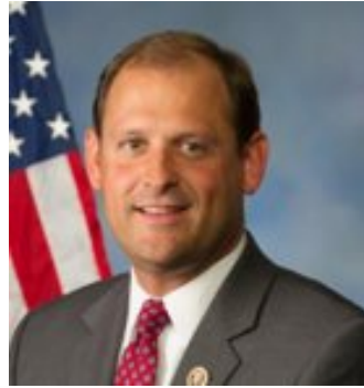
Andy Barr Congressman