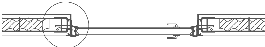
DET. 1 HORIZONTAL SECTION

Subject: FRAME FIXING / MESH REINFORCING DETAIL