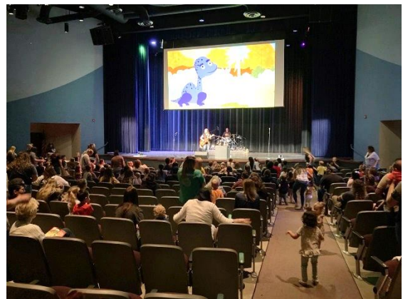
Show for the smaller kids

Next year's ELCS is being planned. You may donate to ELCS on the mailing page form.