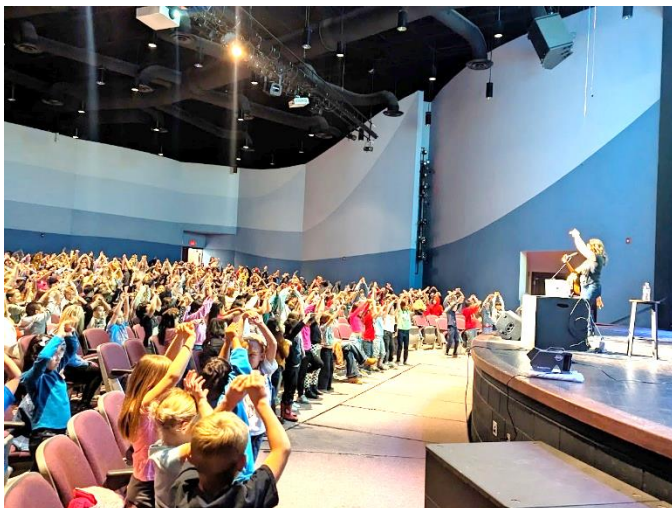
What a Crowd of engaged children!