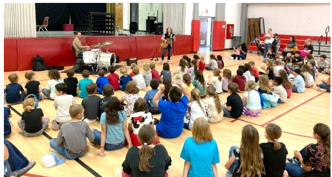
A concert at Duncan Elementary School