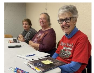
L to R