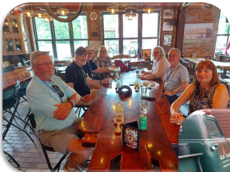
Trip to OLD FLAME BREWERY in Port Perry!