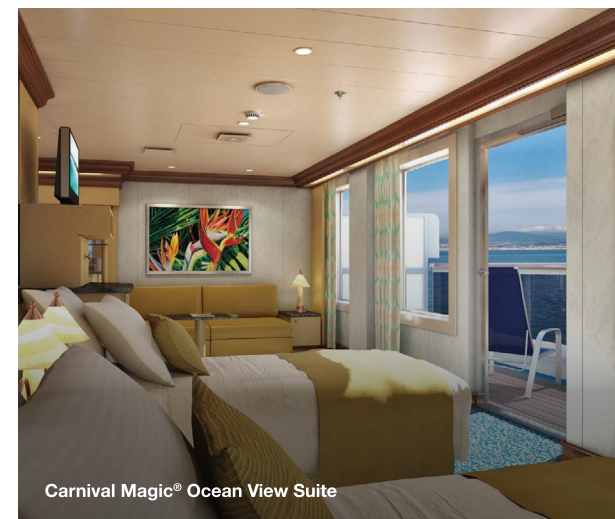
Carnival Magic® Ocean View Suite