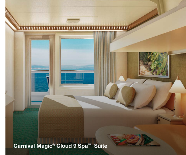
Carnival Magic® Cloud 9 Spa™ Suite

The most affordable way to experience all the excitement without cutting corners on comfort. Full private bathroom, 24-hour room service*, and our famous comfy linens make this the perfect spot to curl up after a long day's fun.