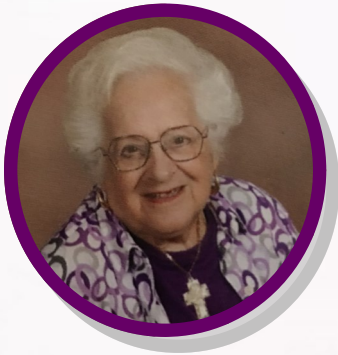
Member since 1984 Died: March 21, 2019