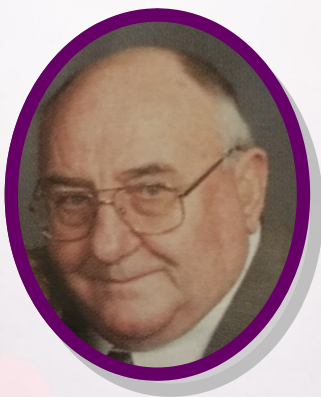
Member since 1987 Died: March 23, 2019