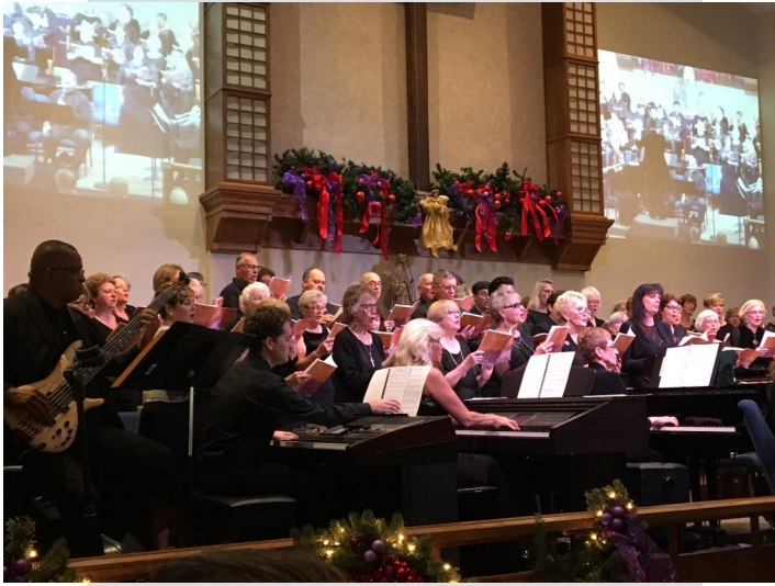
Christmas Cantata, Joy Has Dawned