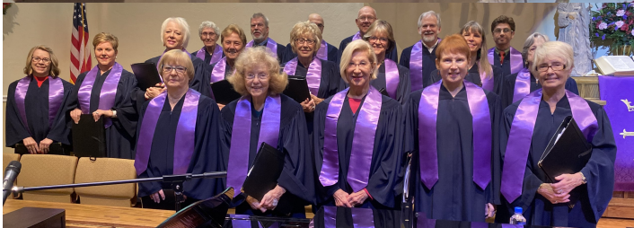
Choir Showing Off Their New Stoles