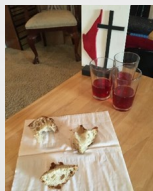
April communion at the Poff house