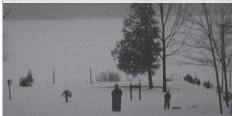
Duck Lake Boat Launch. A picture from the early days!

As noted in the Upcoming Events Calendar, our Spring General Meeting will be Saturday, May 22, at 5:00 pm. You are invited to stay after the meeting and enjoy a bonfire at the new fire pit. We look forward to seeing you at this important meeting.