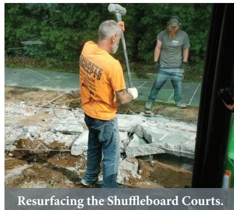
Resurfacing the Shuffleboard Courts.