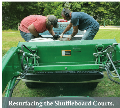
Resurfacing the Shuffleboard Courts.