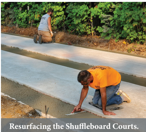
Resurfacing the Shuffleboard Courts.