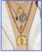
Past, Present, Future

Photographs in the exhibition are printed in partnership with Mpix on Matter Giclee Fine Art Photographic Paper.