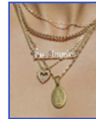
City of Angeles