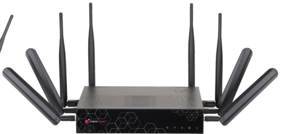
1595 Pro Wi-Fi 5G

Named Leader by Top Analyst Firms: Gartner® Firewall Magic Quadrant™ Forrester Wave™: Enterprise Firewalls 2022