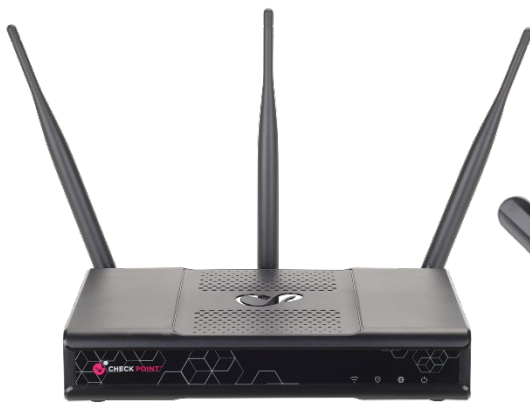
1535 and 1555 Pro Wi-Fi