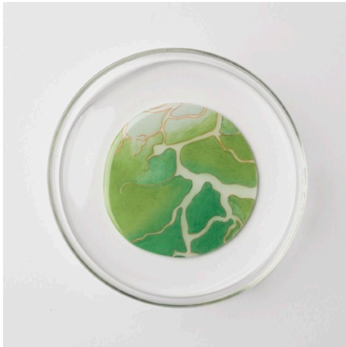
DROP: Keti Bunder South Wildlife Sanctuary, slightly inland of the Gulf of Oman, south of Karachi, Pakistan__No.496, 2020.