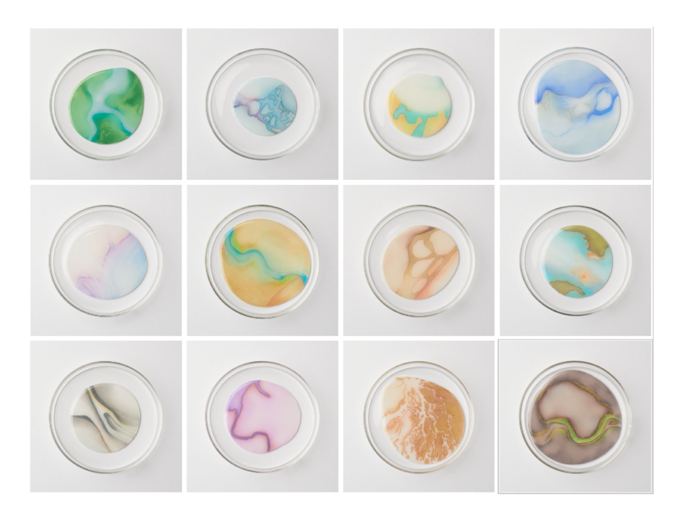
raining I lift my palm, catch a drop and consider our world all over again lb