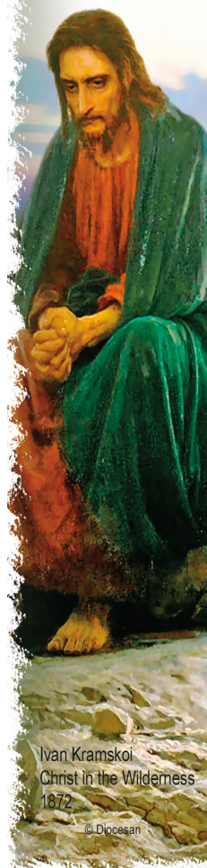
Ivan Kramskoi Christ in the Wilderness 1872

Fish Fry Fridays during Lent 4:30—7:00 PM