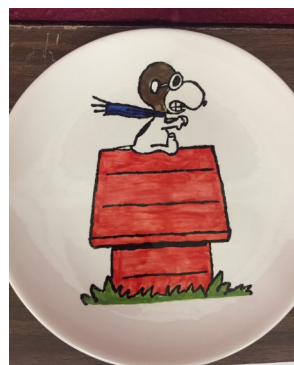
Plate #1 is currently holding the highest bid at $35.00. These plates and bowls have been known to auction for well over $50. Let's see how high these bids will go this year! Join in the fun and take home some beautiful artwork!!

You are now able to view the event I created for pre-bidding on over 60 plates and bowls. You can find the video on either of our Facebook pages as well as our website. Even though the event is no longer LIVE, you can still bid on the pieces of art. You can add a comment to the thread listing your bid and the number of the item that you are bidding on. Or, you can email me with your bid. Either way, I will record it on the bid sheet. I hope that you can join us to check out all this beautiful art that our parishioners have created!