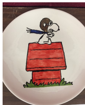
Plate #1 is currently holding the highest bid at $35.00. These plates and bowls have been known to auction for well over $50. Let's see how high these bids will go this year! Join in the fun and take home some beautiful artwork!!

You are now able to view the event I created for pre-bidding on over 60 plates and bowls. You can find the video on either of our Facebook pages as well as our website. Even though the event is no longer LIVE, you can still bid on the pieces of art. You can add a comment to the thread listing your bid and the number of the item that you are bidding on. Or, you can email me with your bid. Either way, I will record it on the bid sheet. I hope that you can join us to check out all this beautiful art that our parishioners have created!