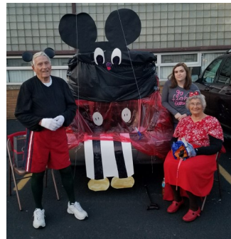
Winners from 2018