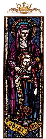
Saint Anne Patroness of the Archdiocese of Detroit

This devotion was planted on the banks of the Detroit River by the original French-Canadian settlers. Two days after Antoine de la Mothe Cadillac landed with 51 others in what is now downtown Detroit on July 24, 1701, they celebrated Mass and began construction of a church named after Saint Anne. Today, Saint Anne de Detroit is the second oldest continually operating parish in the United States. As is now recognized by the Holy See, the Church of Detroit was placed under Saint Anne's protection from its very founding.