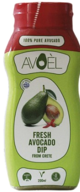
Fresh avocado dip