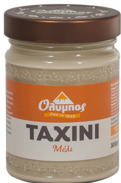
Tahini with Honey 300g