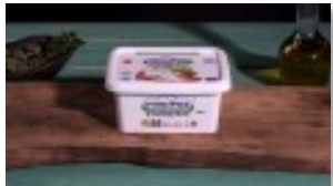
Authentic Greek Feta Cheese, protected designation of origin (PDO)