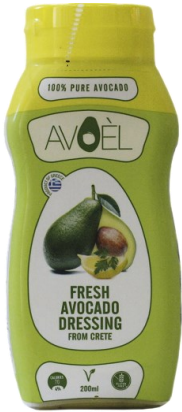
Fresh avocado dressing