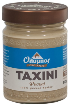
Plain Tahini 300g