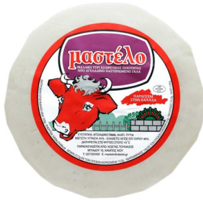
Mastelo Soft Cheese.