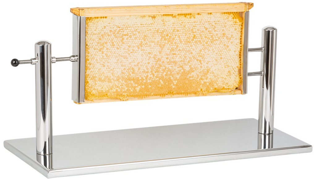
Whole Honeycomb with frame