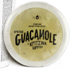
Guacamole ( over cap tray) with carrot or carob breadsticks