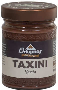
Tahini with Chocolate 300g