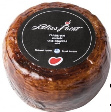
Graviera Cheese 12 months aged in cave