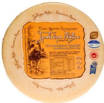
Graviera Cheese from Naxos (PDO)

*From 80% cow's milk at minimum and 20% sheep and goat milk