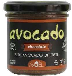
Avocado with chocolate