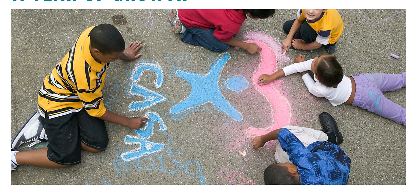
Dear Friends & Supporters,

Fiscal year 2020 was dedicated to growth and expansion of our CASA services and was filled with many accomplishments. For years our agency provided both prevention education and CASA (Court Appointed Special Advocates) for abused and neglected children. Beginning in October 2018 the agency piloted CASA in Carlisle & Hickman Counties. The Board of Directors engaged in a vision planning retreat in January 2019 and as a result the board of directors decided to refine our focus to CASA and expand services. Our business name changed to CASA of Graves County & Southwest KY, Inc. by the start of the fiscal year and our mission statement was revised now reading, The mission of CASA of Graves County & Southwest KY is to provide trained community volunteers for court appointment to advocate on behalf of dependent, abused, and neglected children in Graves County and Southwest Kentucky. In August 2019 expansion into Fulton County was underway and in January 2020 we were appointed to our first case in the county.