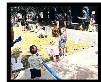
EGG HUNTS for 400 Kids!