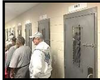
The Lock Up