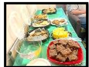
Delicious BBQ and Desserts!