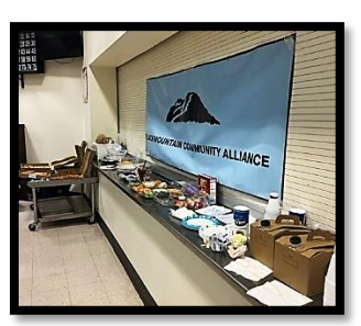
Coffee donated from Starbucks 19<sup>th</sup> Avenue & T-Bird