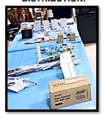
Everyone received something!