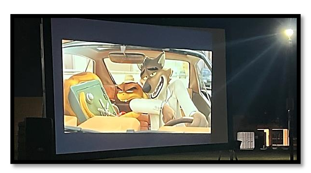
The Bad Guys