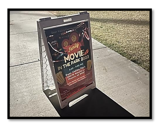
The movie had to be changed from Cheaper by the Dozen to The Bad Guys...

Black Mountain Community Alliance at the MOVIE IN THE PARK 6-9 pm