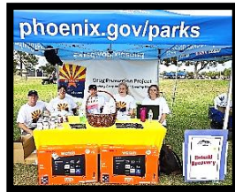
Phoenix Cadets REACH Drug Prevention Education