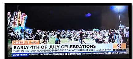
FIREWORKS! Better late than never!