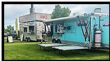
12 Food Trucks!